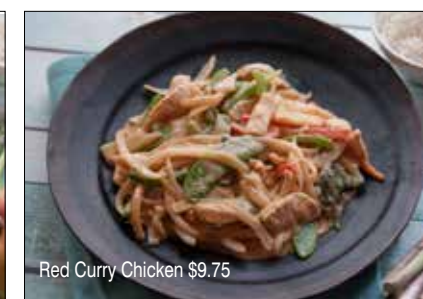
Red Curry Chicken $9.75