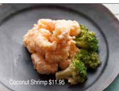
Coconut Shrimp $11.95