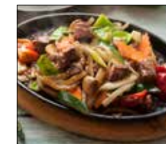
Steak Hibachi $13.95