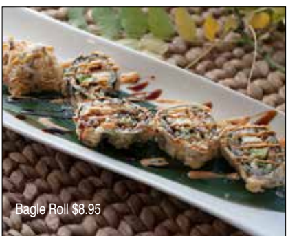
Bagel Roll $8.95