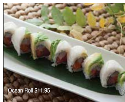
Ocean Roll $11.95