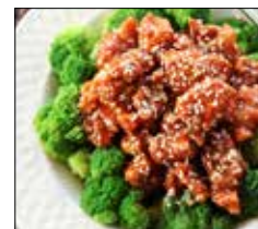
Sesame Chicken $10.50