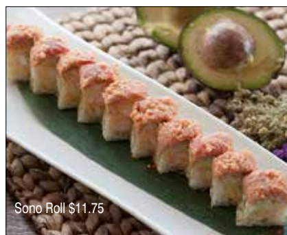
Sono Roll $11.75