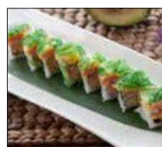
Queens Roll $11.25