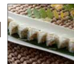
White River Roll $11.95