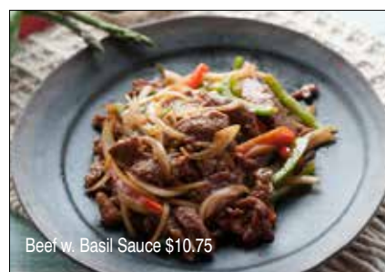
Beef w. Basil Sauce $10.75