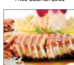
Grilled Squid $7.95