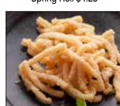
Fried Calamari $6.95