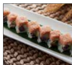
Tuna Lover Roll $11.50