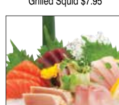
Sashimi Regular $15.95