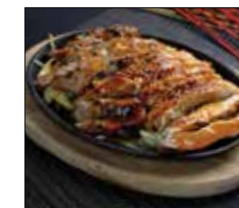
Chicken Teriyaki $11.95