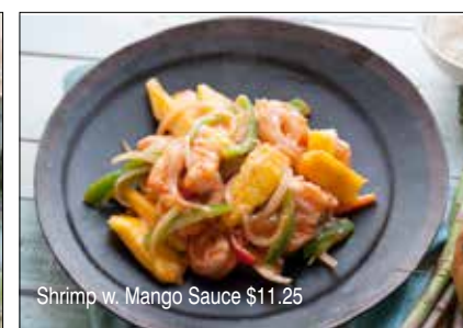
Shrimp w. Mango Sauce $11.25