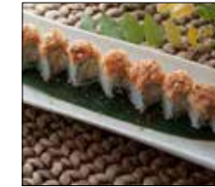
Snow Mountain Roll $11.95