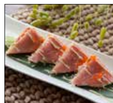
Honey Sandwich $9.95