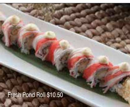
Fresh Pond Roll $10.50