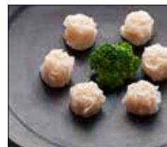
Shrimp Shumai $4.50

Food Allergies? If you have a food allergy, please speak to the owner, manager, chef or your server