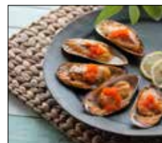
Grilled Mussels $6.95