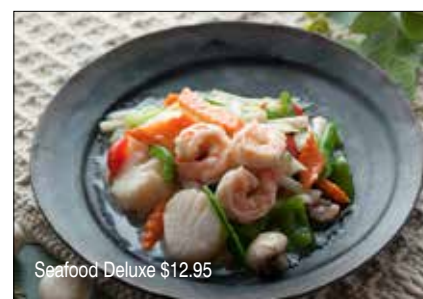
Seafood Deluxe $12.95