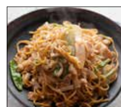
Vegetable Lo Mein $8.25