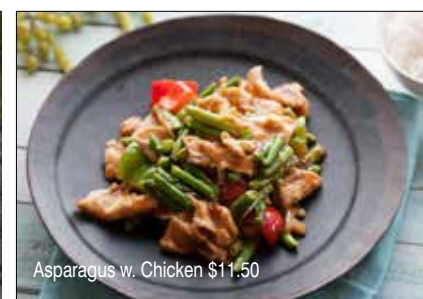
Asparagus w. Chicken $11.50