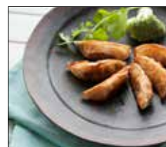
Pork Gyoza $4.50