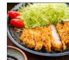
Chicken Katsu $11.95