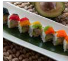
Rainbow Caviar $9.95