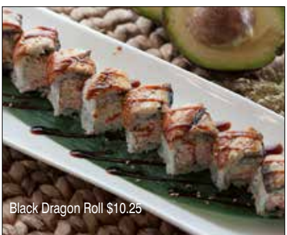
Black Dragon Roll $10.25