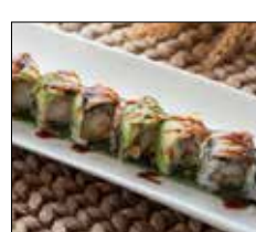
Lucky Roll $11.95