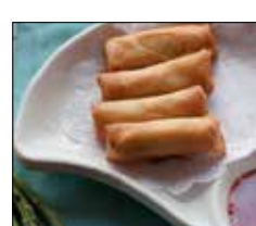
Spring Roll $4.25