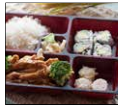
Lunch Bento Box $8.50