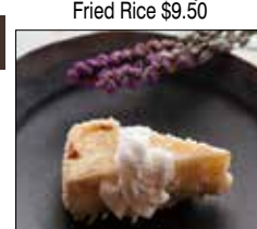
Tempura Cheese Cake $3.95