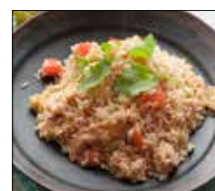
Chicken Thai Style Fried Rice $9.50