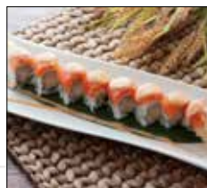
M16 Roll $10.75