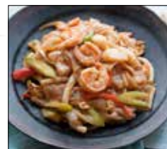
Seafood Pad Kee Mao $12.95