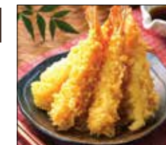
Shrimp Tempura $12.95

Hot and Spicy We can alter the spicy according to your taste