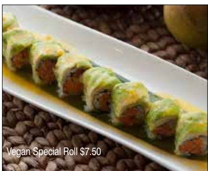
Vegan Special Roll $7.50