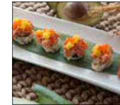
Crispy Spicy Tuna Roll $8.95