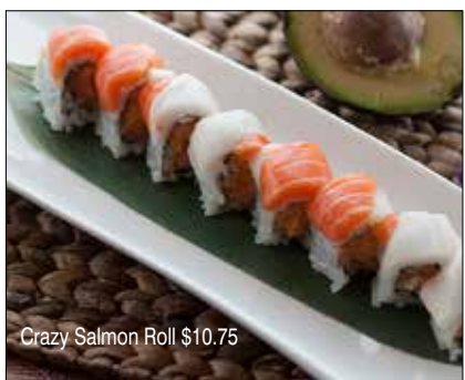
Crazy Salmon Roll $10.75